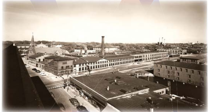
The original American-Marsh facility located in Battle Creek, Michigan, USA (Photo taken around 1950).

Our entire product family reflects years of customer input, product upgrades, redesign and new product development...all focused on meeting and exceeding our customers expectations. For over 135 years, the American-Marsh Pump designs have proven their durability by withstanding the test of time. Our commitment to customer service and satisfaction will ensure that the American-Marsh Pumps Product line will be around for the next 135 years.